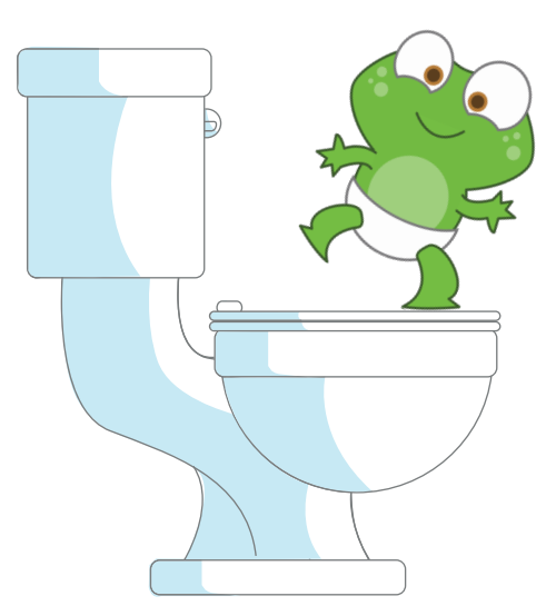
For more great potty training resources, visit www.pottytime.com