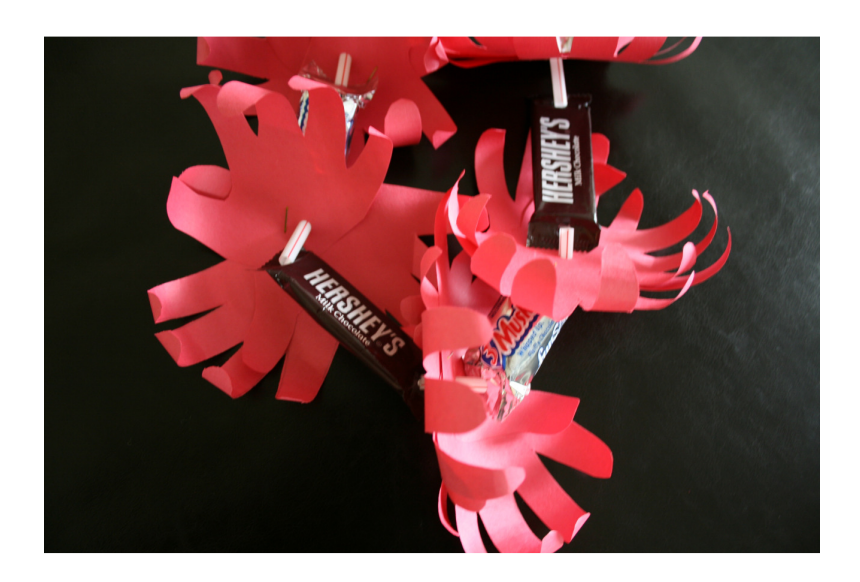
Step 12: Continue to thread the ribbon, alternating candy bars and flowers. Tie the two ends of the ribbon together to complete the lei.